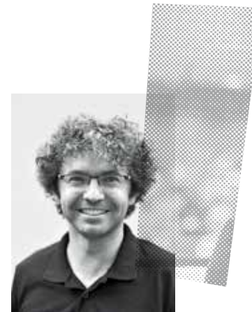
ONDŘEJ BESPERÁT Photographer

Jenda.Zacek@AspenInstituteCE.org @JendaZacek